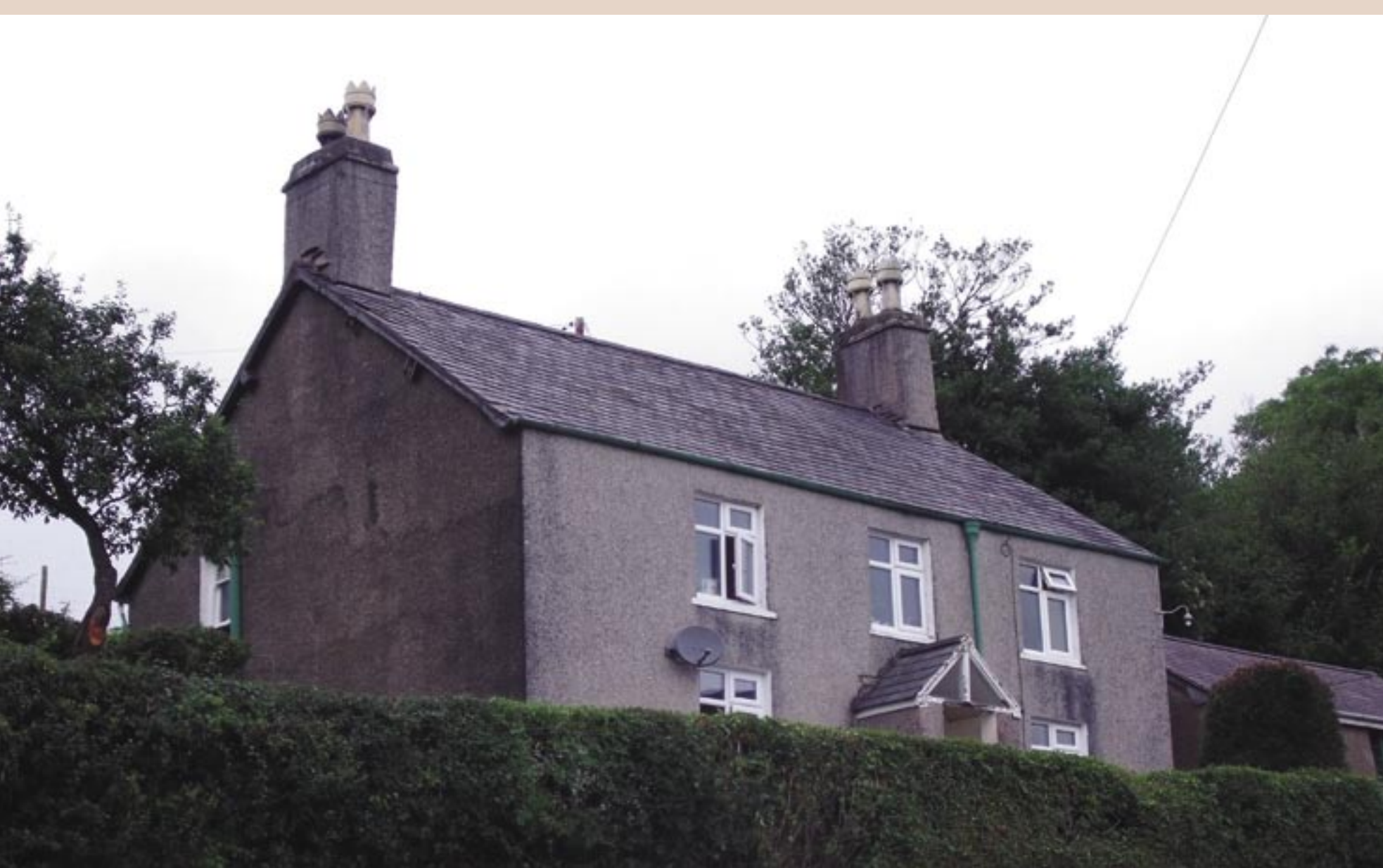
Llwyn Du Isaf

'In it, the reader will see rare spiritual, cultural and literacy talent and some of the glories of Welsh folk of yesteryear.'