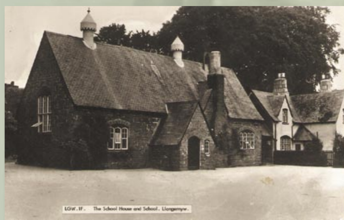
Tŷr Ysgol a'r Ysgol ar ddechrau'r 20fed ganrif. The School House and the School in the early 20th century.